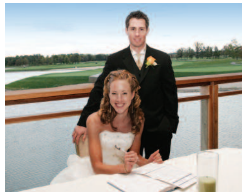
VENUE: LEGENDS ON THE NIAGARA