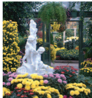
VENUE IMAGINISTE FLORAL SHOWHOUSE