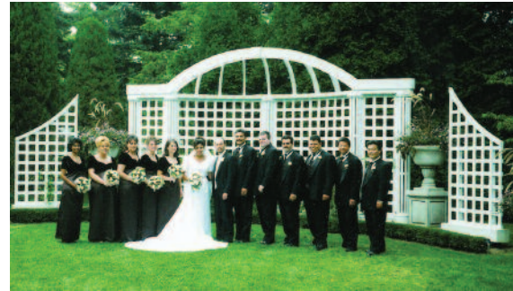
VENUE: BOTANICAL GARDENS