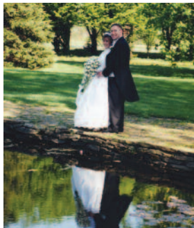
VENUE: BOTANICAL GARDENS WILLOW POND

FLORAL SHOWHOUSE – Discover paradise in sheer elegance. Celebrate your love in the Rose Garden with the distant roar of the Falls as your backdrop, or amid ponds and tall grasses in the Artists Garden for a serene and sophisticated garden ceremony.