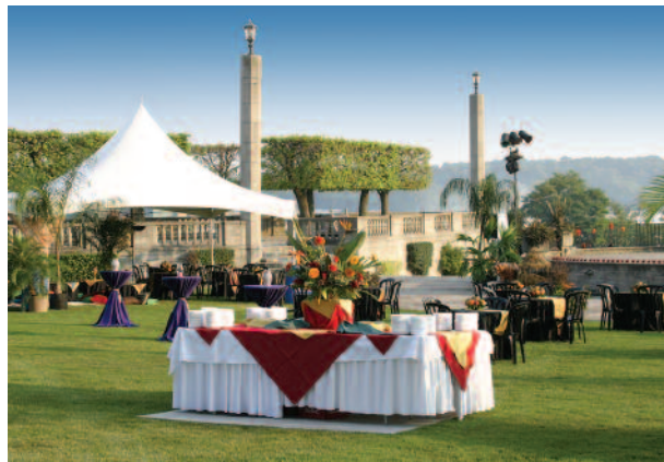
VENUE OAKES GARDEN THEATRE