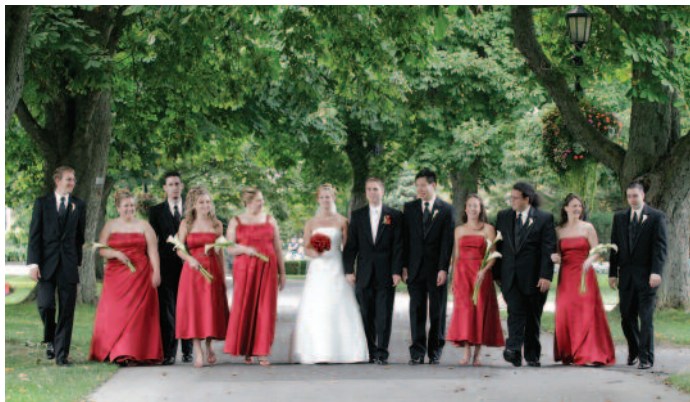
VENUE: ROTUNDA GARDENS

Make your special day a magical experience that reflects a style that's yours alone. Choose the perfect Niagara Parks ceremony site to harmonize with your unique vision.