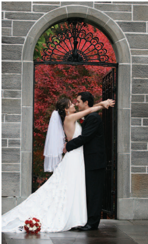
VENUE: OAKS GARDEN THEATRE