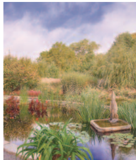
VENUE: ARTISTS GARDEN AT FLORAL SHOWHOUSE