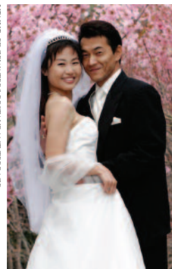
VENUE: OAKES GARDEN THEATRE

LEGENDS ON THE NIAGARA – An exclusive club created of stone, mahogany and cedar is surrounded by manicured greens, an enchanting lake and the open-air beauty of a covered terrace.