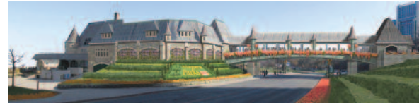
VENUE: ELEMENTS ON THE FALLS

ELEMENTS ON THE FALLS RESTAURANT & GRAND HALL – The grandest of the grand. Without question the breathtaking views here at the brink of the Falls are the best anywhere! Our entirely new flagship venue is a place like no other, stylishly reflecting the elements of water, wind, earth and fire. From the hand-made designer glass to the exquisite menu and fine wines, this is a level of luxury that is unequalled.