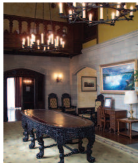
VENUE OAK HALL ESTATE

OAK HALL ESTATE – Niagara’s historic castle full of sophistication and old-world allure, complete with candelabras, a stone fireplace and open-air terrace.