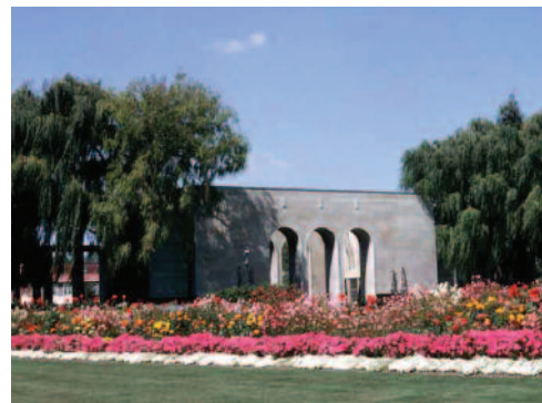
VENUE: MATHER ARCH PARK

OAK HALL ESTATE – Historic and Stately. From the picturesque Tudor-style mansion to its surrounding greens, the estate sets the scene for a celebration steeped in tradition and elegance.