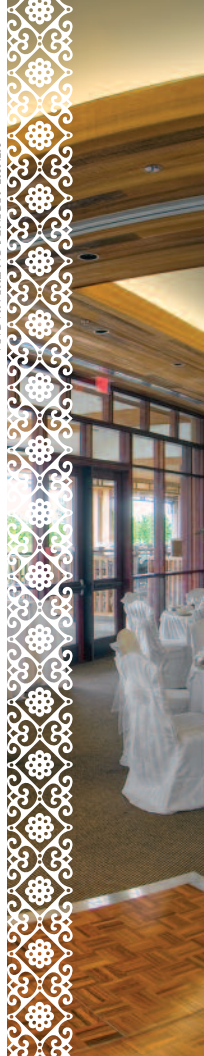
VENUE: LEGENDS ON THE NIAGARA

LEGENDS ON THE NIAGARA – An exclusive club created of stone, mahogany and cedar is surrounded by manicured greens, an enchanting lake and the open-air beauty of a covered terrace.