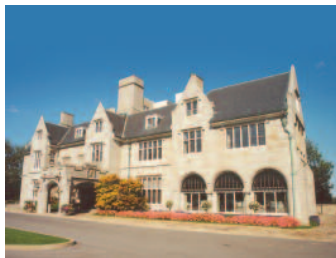
VENUE: OAK HALL ESTATE