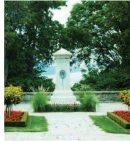
VENUE: LAURA SECORD MONUMENT

BOTANICAL GARDENS WEDDING ARBOUR – Simple charm at its best - a Victorian-style arbour amid a lush garden. Truly a magical setting.