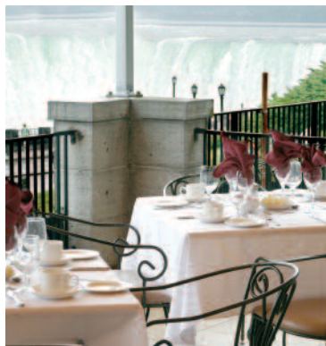
VENUE: EDGEWATERS RESTAURANT TERRACE

EDGEWATERS RESTAURANT & TERRACE – Spectacular views of both the Horseshoe and American Falls complimented by an outdoor terrace and the exclusive Commissioners Quarters - a relaxed yet elegant atmosphere in a living room setting with separate dance area.