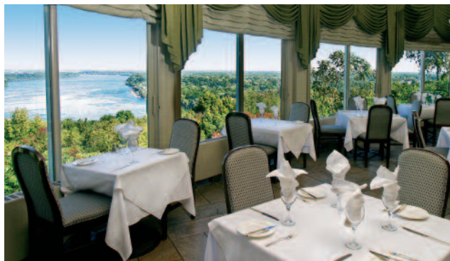
VENUE: QUEENSTON HEIGHTS RESTAURANT

QUEENSTON HEIGHTS RESTAURANT – Serene beauty, an incredible view of the Niagara river below and an award-winning VQA Wine Collection combine with first-class cuisine to make this a favoured choice.