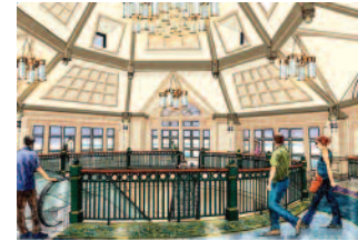
VENUE: GRAND HALL