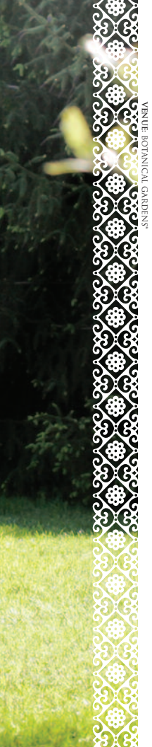
VENUE BOTANICAL GARDENS