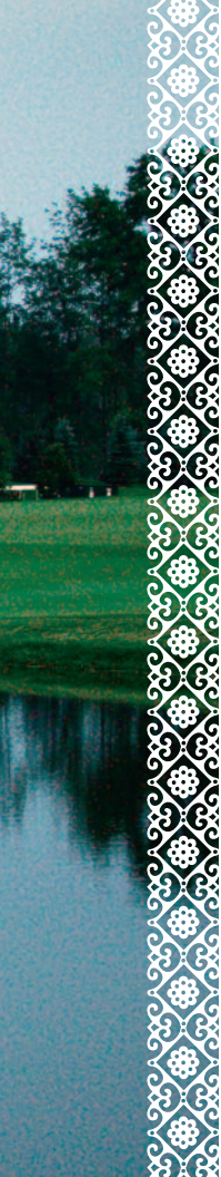
VENUE: LEGENDS ON THE NIAGARA