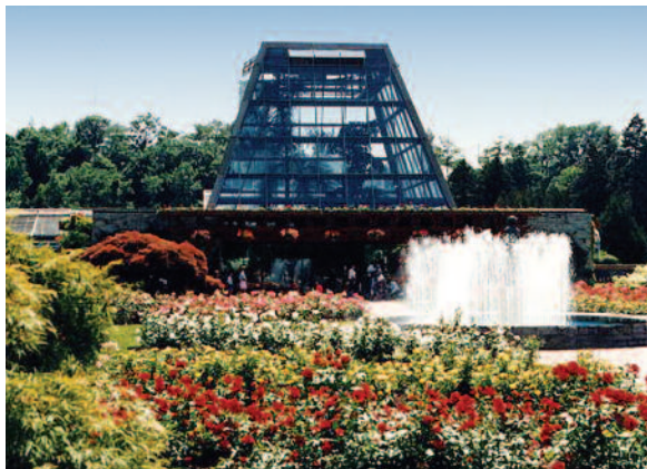
VENUE: FLORAL SHOWHOUSE